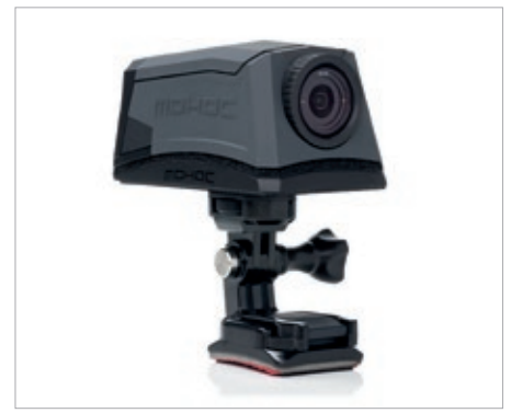
ACTION CAMERA MOUNT