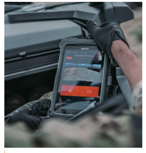
MOHOC APP ENABLES TEAMMATES AND COMMANDERS TO VIEW VIDEO REMOTELY