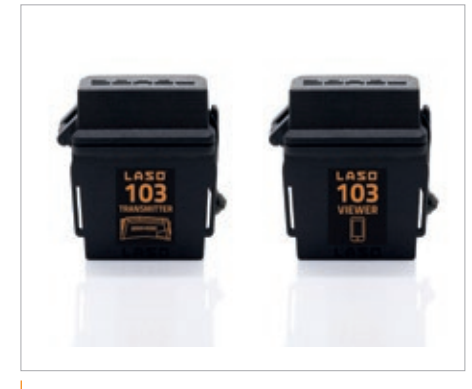
SIMPLE, RUGGEDIZED, TWO-PART PAIRED WIFI BOOSTER SYSTEM