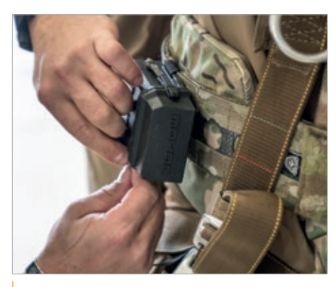
CAN BE CARRIED ON A TACTICAL VEST, K9 HARNESS OR BACKPACK