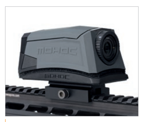
PICATINNY RAIL MOUNT