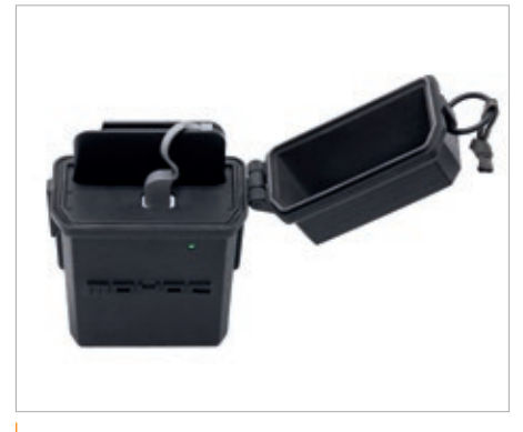
UNITS INCORPORATE INTERNAL BATTERY WITH NO EXTERNAL CABLES