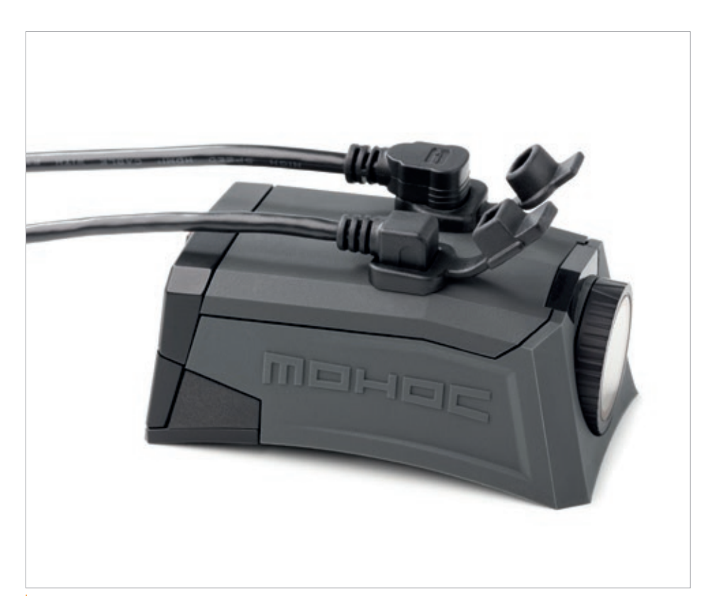
90° CABLES PROVIDE LIVE FEED