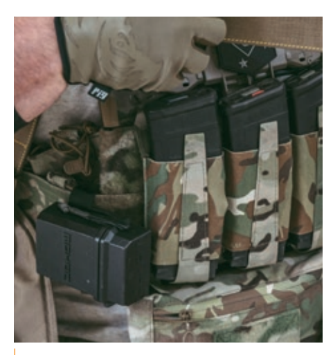
TRANSMITTER UNIT ACCOMPANIES THE OPERATOR & IS MOLLE COMPATIBLE

LASO™ is the ideal Tactical Video Transmitter for both training and live operations where short-range video streaming is required. The many usecase scenarios include EOD, clearing, K9, and riot control.