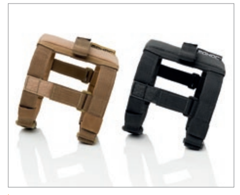
AVAILABLE IN TAN (MH-K9T) AND BLACK (MH-K9BK)