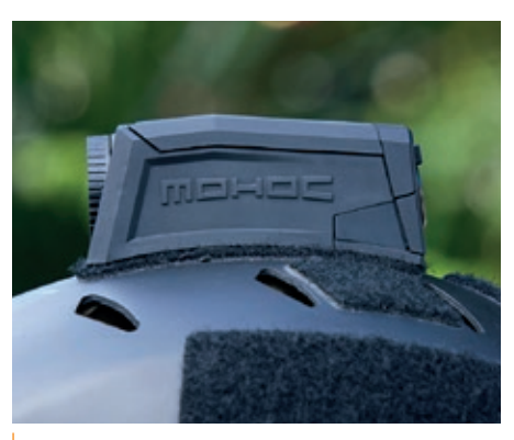
TACTICAL FORM FACTOR HELMET CONTOUR, LOW PROFILE, SNAG-FREE