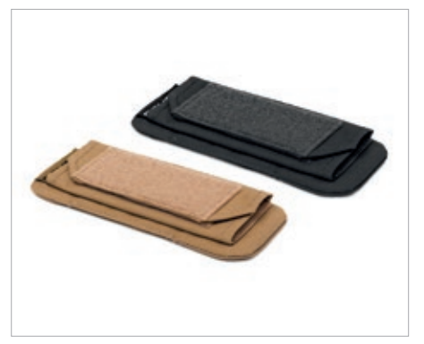
AVAILABLE IN TAN (MH-SMT) AND BLACK (MH-SMBK)