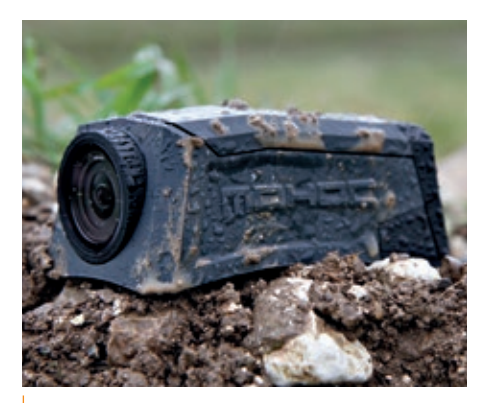
MILITARY RUGGEDIZED WATERPROOF, DROP-PROOF, MISSION READY