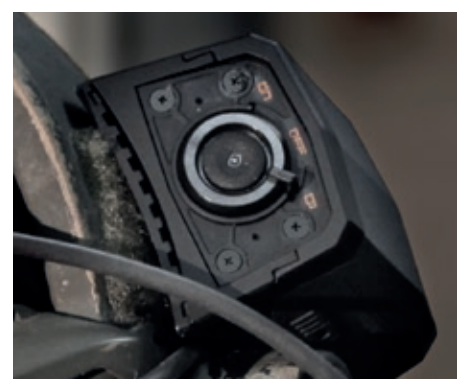
INTUITIVE USE SIMPLE TACTILE OPERATION & VIBRATION ALERTS