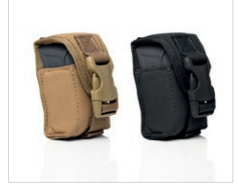
AVAILABLE IN TAN (MH-MCT) AND BLACK (MH-MCBK)