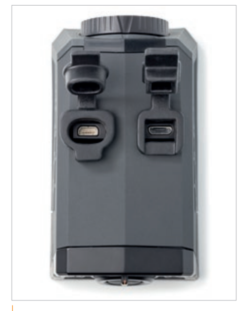
MICRO HDMI & MICRO USB PORTS

The Hardwire Door is easily installed even when wearing gloves, and interchangeable with the standard door when complete waterproofing is required.