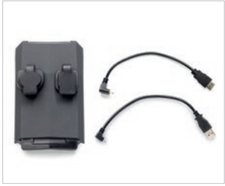
INCLUDES HARDWIRE DOOR & CABLES (MH-HWD)